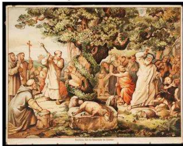
"Boniface Fells the Sacred Oak Near Geismar" by Heinrich Maria von Hess (1844)

Sunday Hours & Divine Liturgy at 9:10 AM, followed by agape potluck Other services as announced