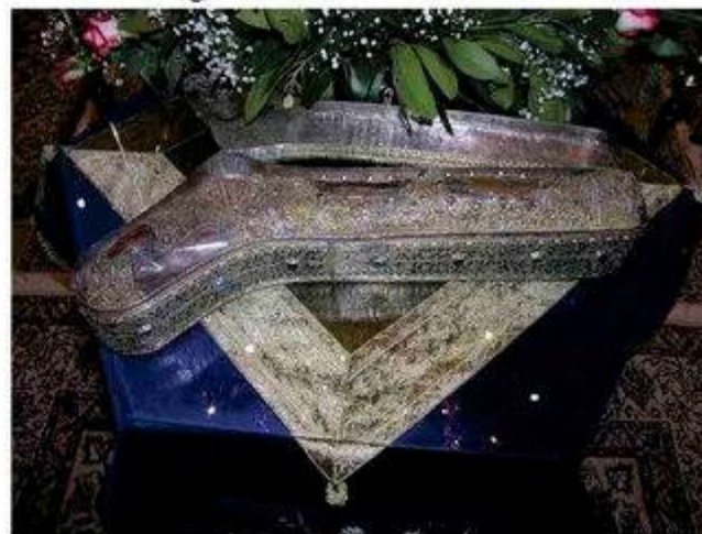
The holy, incorrupt foot of St. Photini the Samaritan Woman and Great Martyr, Monastery of Iveron, Mount Athos

Sunday Hours & Divine Liturgy at 9:10 AM, followed by agape potluck Other services as announced