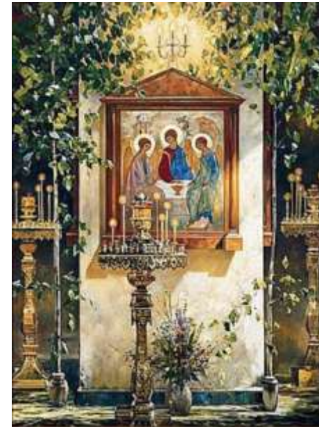
The Holy Trinity by Vasili Nesterenko (2004)

Sunday Hours & Divine Liturgy at 9:10 AM, followed by agape potluck Other services as announced