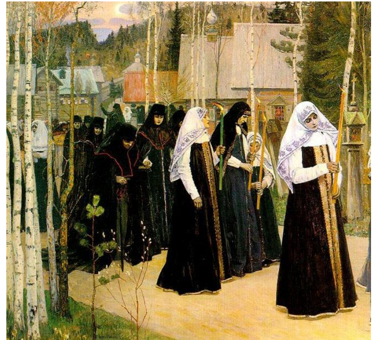
The Great Taking of the Veil by Mikhail Vasilievich Nesterov (1898)