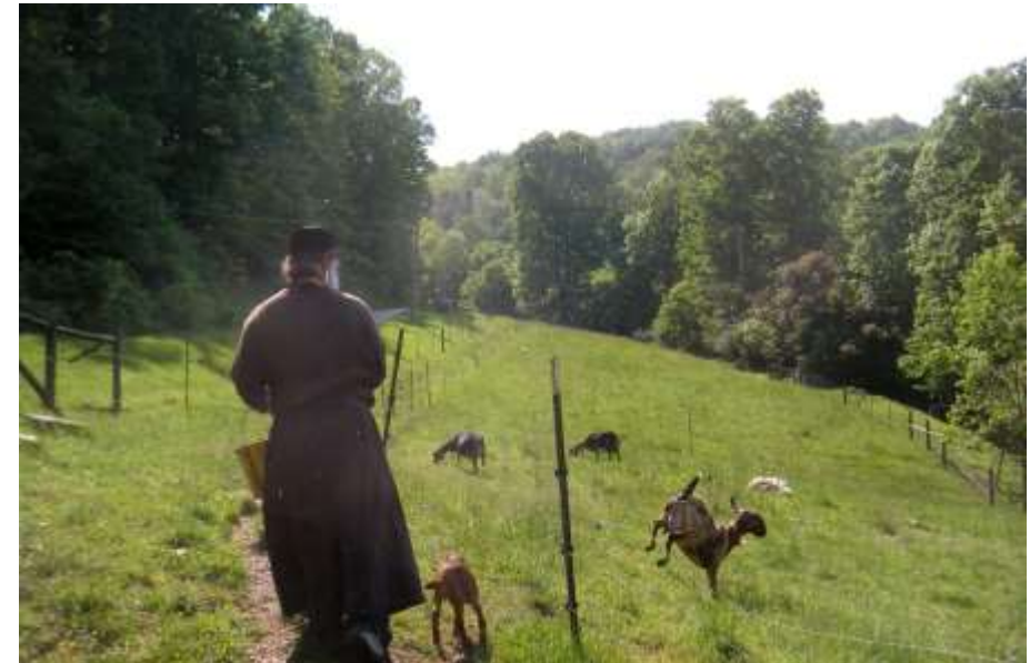
A hieromonk blesses animals and crops on the Mid-Feast of Pentecost

Sunday Hours & Divine Liturgy at 9:10 AM, followed by agape potluck Wednesdays at 6:30 PM – Evening Prayers & Saints of the Day Other services as announced