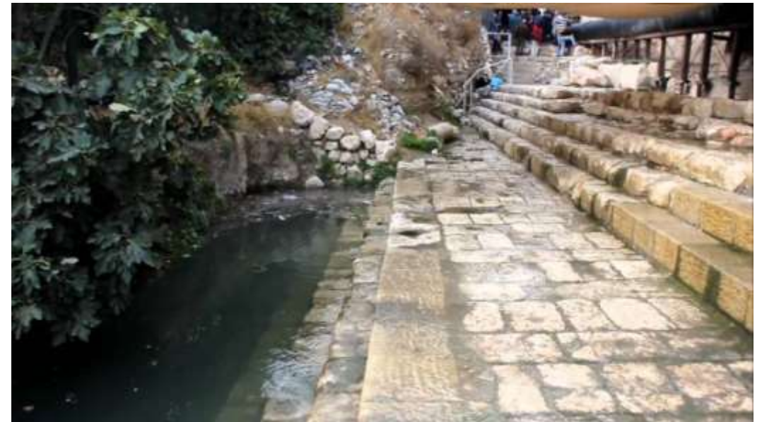
The Pool of Siloam today

Sunday Hours & Divine Liturgy at 9:10 AM, followed by agape potluck Wednesdays at 6:30 PM – Evening Prayers & Saints of the Day Other services as announced