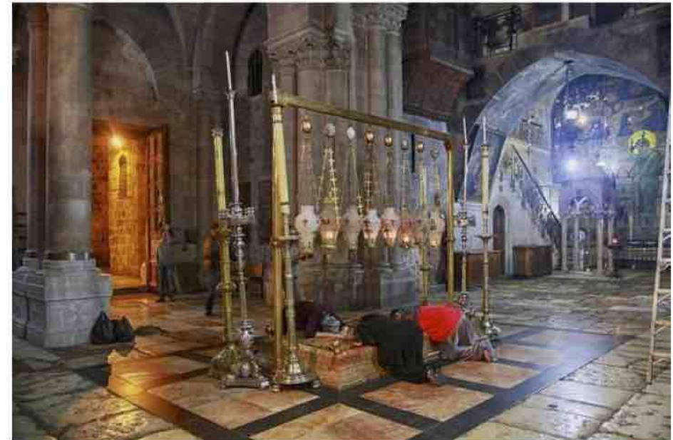
Stone of Anointing, Church of the Holy Sepulcher, Jerusalem

Sunday Hours & Divine Liturgy at 9:10 AM, followed by agape potluck Wednesdays at 6:00 PM ~ Evening Prayers & Saints of the Day Other services as announced