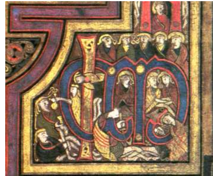
The Last Judgment from the Book of Kells (c. 800 AD)

Sunday Hours & Divine Liturgy at 9:10 AM, followed by agape potluck Wednesdays at 6:30 PM – Evening Prayers & Saints of the Day Other services as announced