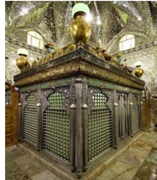
Tomb of the Holy Prophet Daniel in Shush, Iran

Sunday Hours & Divine Liturgy at 9:10 AM, followed by agape potluck