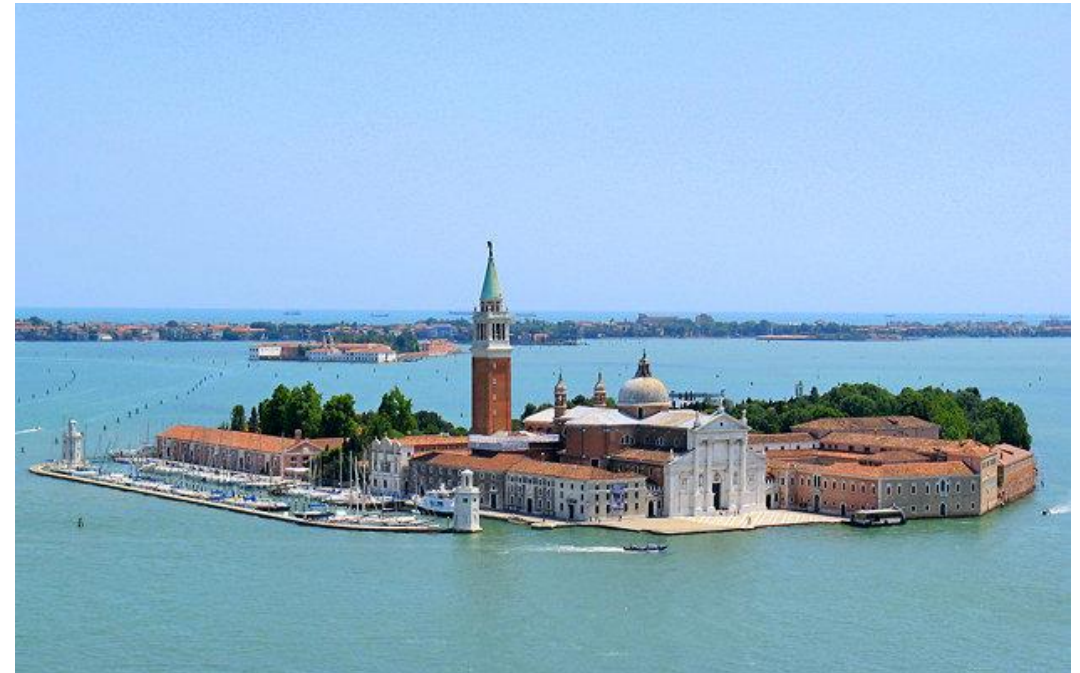
The Church of San Giorgio Maggiore in Venice, where lie the relics of St Paul the Confessor

Sunday Hours & Divine Liturgy at 9:10 AM, followed by agape potluck Other services as announced