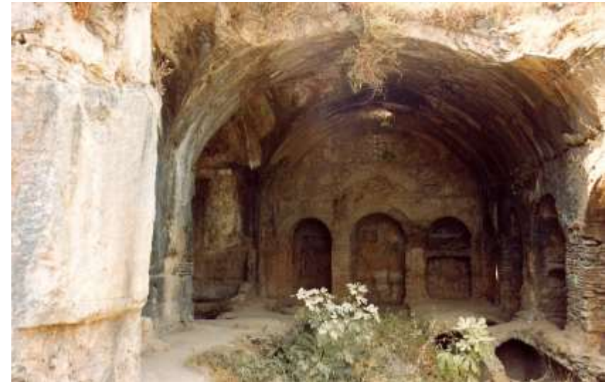
The Cave of the Seven Youths of Ephesus. According to tradition, this cave was also the original burial place of St. Mary Magdalene

Sunday Hours & Divine Liturgy at 9:10 AM, followed by agape potluck Wednesdays 6:30 PM – Evening Prayers & Saints of the Day Other services as announced