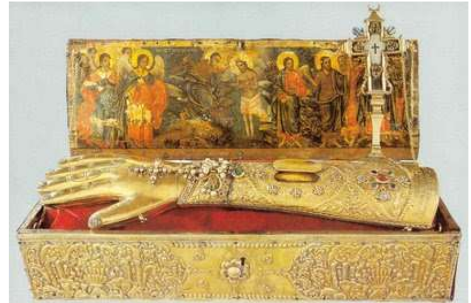
Portion of the Right Hand of the Forerunner, Dionysiou Monastery, Mount Athos

Sunday Hours & Divine Liturgy at 9:10 AM, followed by agape potluck Wednesdays at 6:30 PM – Evening Prayers & Saints of the Day Other services as announced