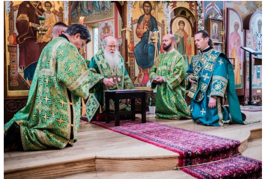
Kneeling Vespers at St. Nicholas Cathedral, Washington, DC

8 th Sunday of Pascha: Pentecost Feast of the Holy Trinity