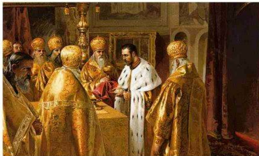
Tsar Nicholas II receiving communion (as a priest) at his coronation (1894).

Holy Fathers of the First Six Ecumenical Councils