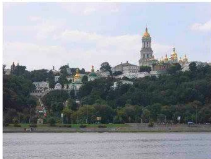
The Kiev Caves Lavra

Sunday Hours & Divine Liturgy at 9:10 AM, followed by agape potluck Other services as announced