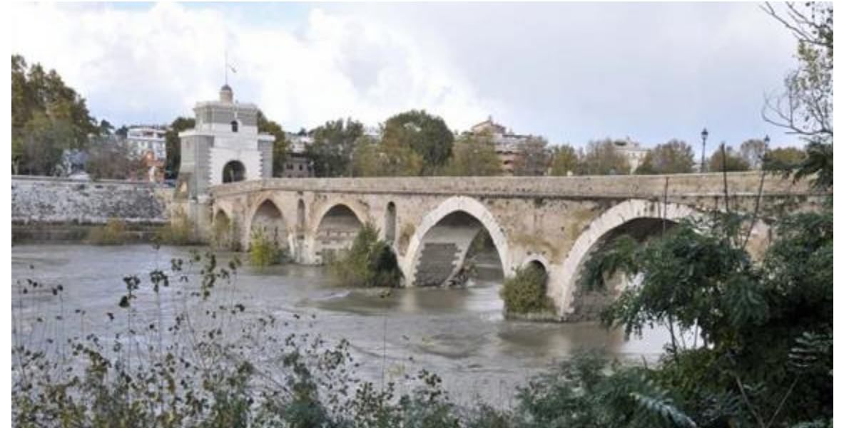
The Milvian Bridge, Ponte Milvio, Italy, where St Constantine beheld the Cross

Sunday Hours & Divine Liturgy at 9:10 AM, followed by agape potluck Other services as announced