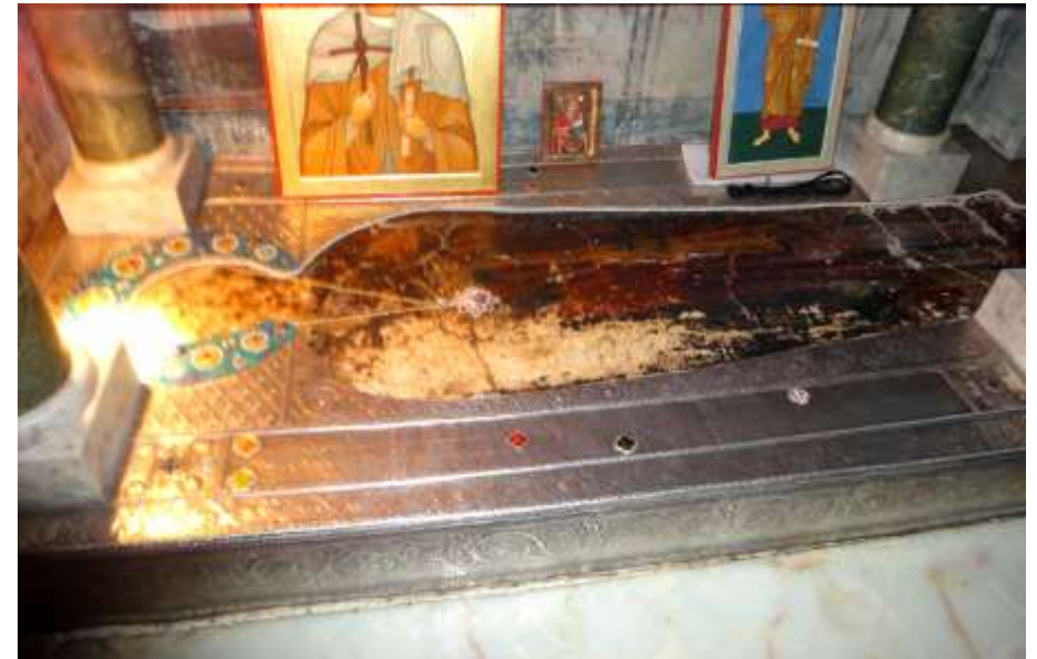
Relics of St Nina at the Monastery of St. Nina at Bodbe, Kakheti, Georgia

Sunday Hours & Divine Liturgy at 9:10 AM, followed by agape potluck Wednesdays at 6:30 PM – Evening Prayers & Saints of the Day Other services as announced